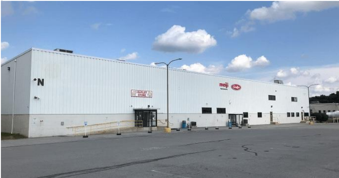
[Meiji America exterior]

Working under the Meiji Group 2026 Vision, we are aiming for the realization of medium and long-term increases in our corporate value. One of the core policies towards of this Vision is to establish growth foundations in overseas markets. By FY2026, we are aiming for overseas sales to represent 10% or more of total net sales. We will achieve this goal by strengthening our global production structure to help popularize products characterized by value unique to Meiji and offer high-value-added products.