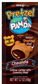
New product Hello Panda Pretzel

The Hello Panda brand of products we currently sell were launched in America in the 1990s, with production conducted in America since 2015. With sales channel expansion, sales in America have increased nearly three-fold* 1 since 2017. To respond to growing demand, we are investing nearly US $28 million (approx. ¥4.1 billion* 2 ) to increase production capacity for Hello Panda. By FY2026, we will aim to increase sales by roughly 50% compared to FY2023.