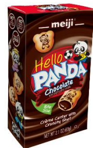
Some products from the Hello Panda Brand