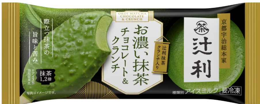
Tsujiri Okoi Matcha Chocolate & Crunch (90ml) MSRP: 216 yen (tax included)